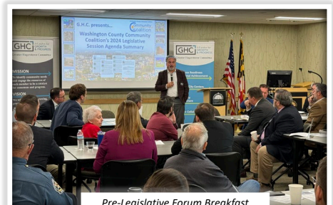
Pre-Legislative Forum Breakfast 11/06/2023