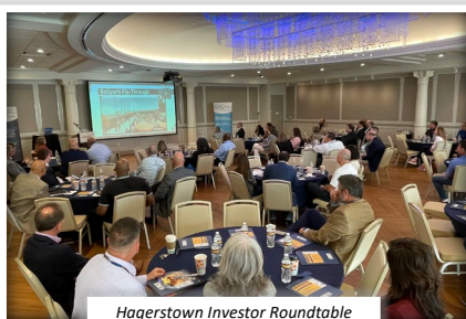
Hagerstown Investor Roundtable 09/14/2023

GHC's success is derived from its members, the community forums they create, and the networks they have established to discuss, debate, and ultimately impact vital issues. Individually and together, GHC members are active in our community, stay abreast of current affairs, and understand the paths of influence necessary for change. This allows GHC to intervene at a strategic point and leverage the strengths of its members to affect, motivate, and influence positive change for our region.