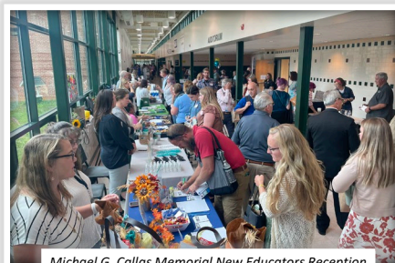
Michael G. Callas Memorial New Educators Reception 08/09/2023