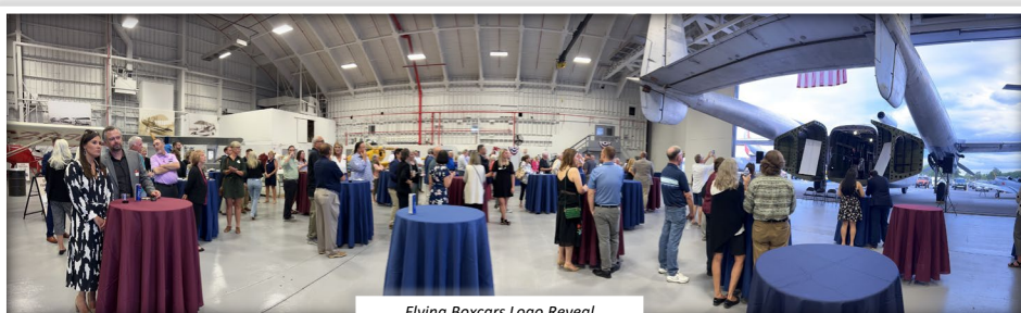
Flying Boxcars Logo Reveal 09/13/2023