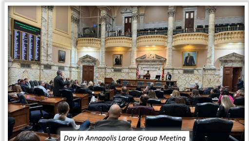
Day in Annapolis Large Group Meeting 01/23/2024